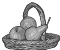
Basket B 8 kg