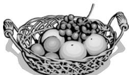
Basket A 12 kg