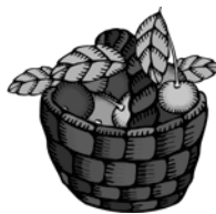
Basket C 16 kg